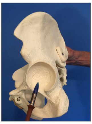
Figure 1 The torso, posterior view Figure 2 The torso, anterior Figure 3 The pelvis, posterior view Figure 4 The acetabulum

forward-facing cup that is placed laterally and slightly forward (figure 4).